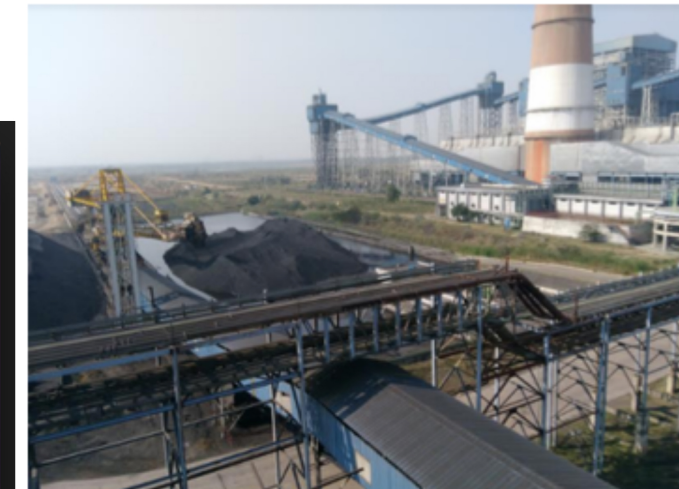
Automated CoalYard thermal Monitor & cooling system Adani Power